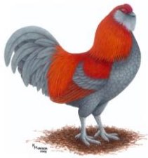
Blue Wheaten Portrait

a meet for a specific show in time for the distribution of information via the ABC quarterly Bulletin prior to the entry deadline for that show".